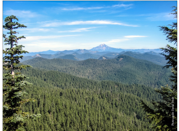
Middle Santiam Watershed